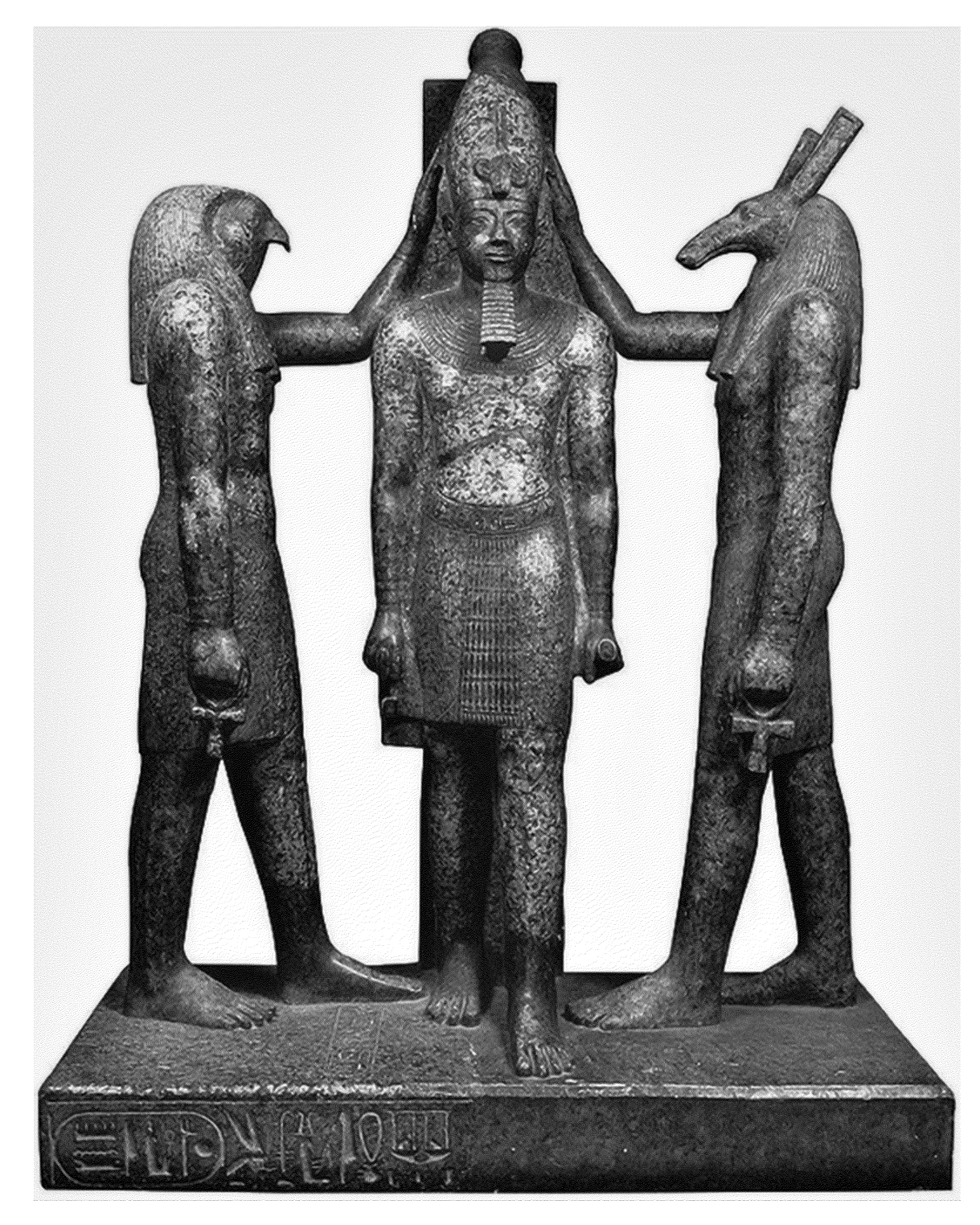
Figure 4.1: Ramses III with Set & Horus. Originally found at Medinet Habu. 20th Dynasty. (Egyptian Museum of Cairo JE 31628. Image public domain.)