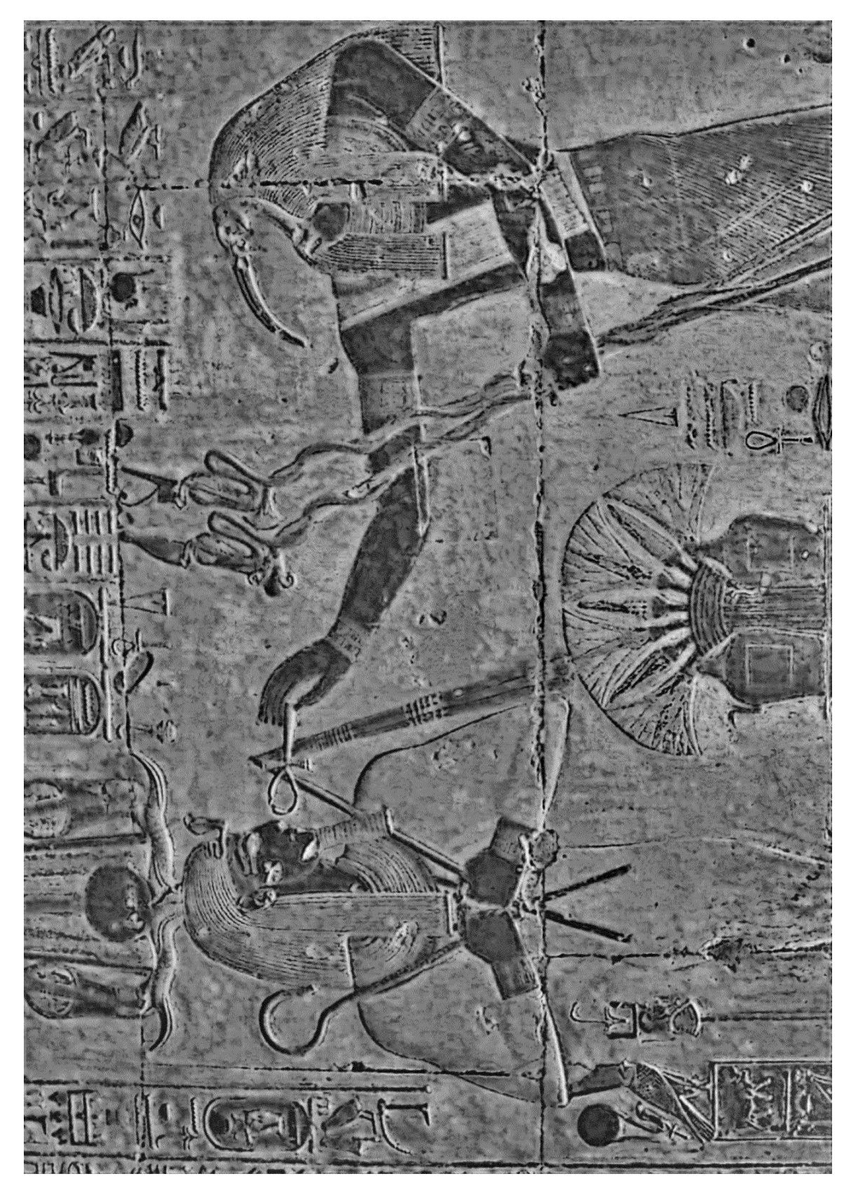
Figure 4.3: Djehuty with king, Temple of Seti I at Abydos, c. 1280 B.C. (Image public domain.)